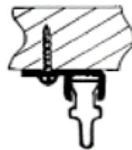
3110/3294 Ceiling Mount