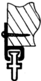
3108/3296 Concealed Mount