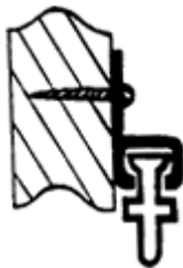
3108/3296 Wall Mount